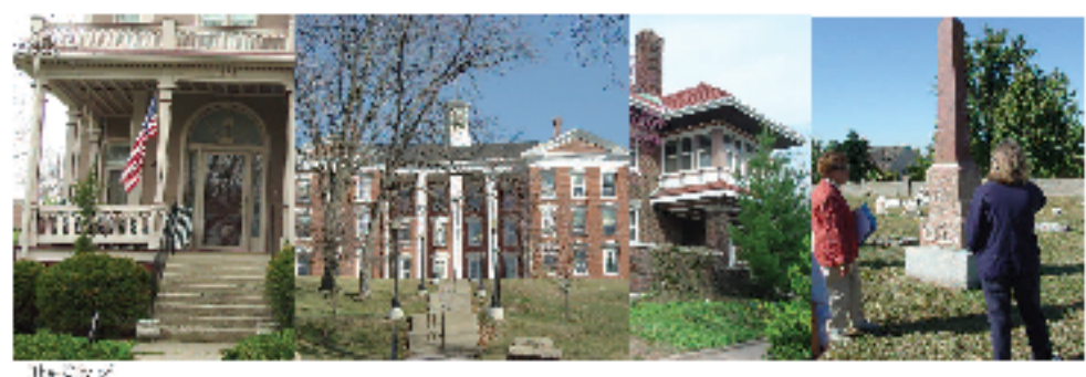
Co-sponsored by the City of Liberty's Preservation Office (www.ci.liberty.mo.us) and Historic Liberty, Inc. (www.HistoricLiberty.org).

Saturday, October 1 Jewell & Lightburne Historic Districts Tour meets at the parking lot at the corner of Franklin and Lightburne Streets